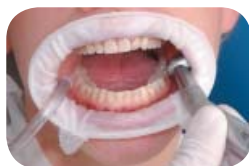
Restorative & Laser Treatments