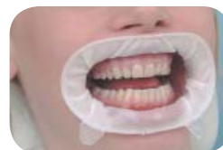
Imaging & Whitening