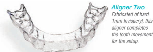
Aligner Two Fabricated of hard 1mm Invisacryl, this aligner completes the tooth movement for the setup.

Inner laminate is soft and highly elastic to provide exceptional tooth movement, seating, and patient comfort.