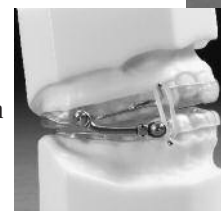
New Telescopic Advancement Hardware